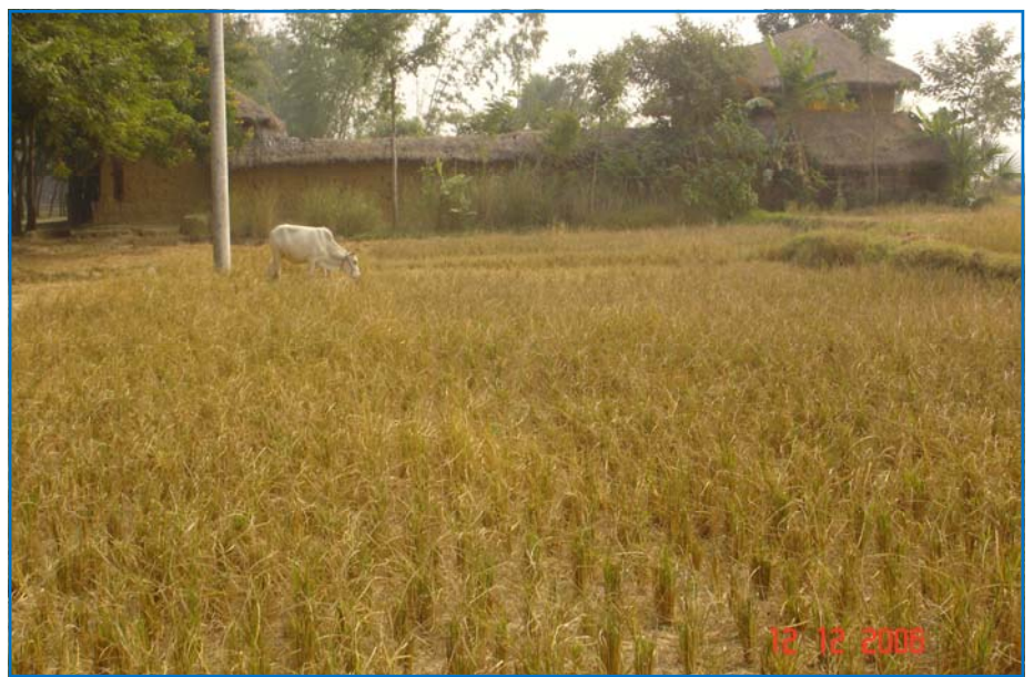
Crop failure due to drought in Gomastapur Rajshahi.

Unfortunately, the current development strategies in many countries tend to overlook climate change risk and its impacts on development and poverty. But according to the scientific community, climate change is already happening and this has been demonstrated through various recent extreme climatic events around the world such as prolonged and severe floods in South Asia, heat weaves in Europe, cyclones and droughts. The 1990s was the warmest decade and the year 1998 was the warmest on record. The current century is expected to see warming quicker than at any time in the past 10,000 years due to many anthropogenic activities. It seems that we cannot prevent climate change, which will have many adverse impacts on human, social and natural systems in different degrees across the world. Hence, we must adapt with the changing climate and at the same time reduce various risks and vulnerability associated with