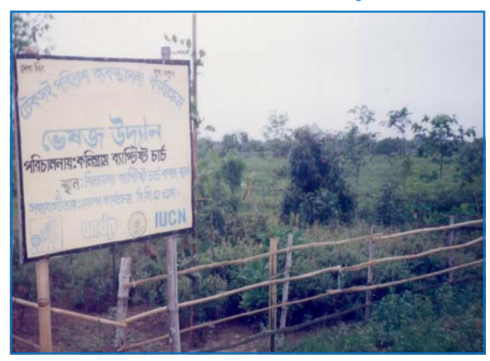
The view of a community nursery of medicinal plants at SEMP-CBFRM Kaligram in Gopalganj district under Source: BCAS intervention.

utilization and regeneration practices in agriculture, forest and fisheries. The information secondary was also reviewed, analyzed and compared with the primary information gathered under the projects. Further, several studies were carried out on specific species that are nationally or globally threatened namely, Ganges River Dolphin (Plantanista gangetica) or just because of their importance in the ecosystem, e.g. the little Cormorant (Phalacrocorax niger). Studies were also conducted on three different animal groups with economic and ecological significance, namely, snails, butterflies and bats.