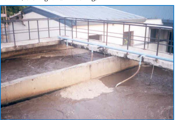
A Pollutant Minimization Plant in a Textile Industry, Gazipur.

Finishing: Design fabrics such that the need less chemical finishes more mechanical finishes. Minimize volatile chemical use. Install automated chemical dispensing systems. Use formaldehyde-free cross-linking agents. Investigate the use of spray application of finishes as these have a low add-on and require no residual dumping at the end of a run. - Mahbubul Haque