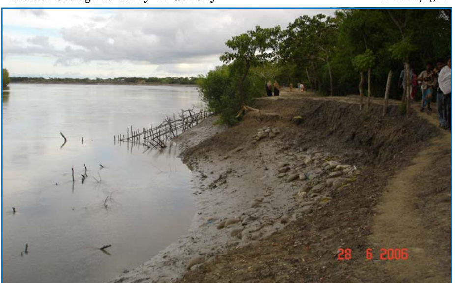
Coastal Embankments are being eroded due to high tide in Shyamnagar in Satkhira.