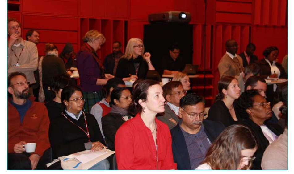
Partial view of the participants of a seminar on Climate Change and Development, which was jointly organized by IIED and BCAS in Copenhagen during the COP-15

The Copenhagen Climate Conference has been criticized for its weak process and poor outcomes. The draft accord does not reflect a global aspiration in terms of setting target for GHG reduction and concrete actions by the developed and newly emerging economics to avoid dangerous climate change in the near future. However, the draft accord acknowledged that climate change is one of the greatest challenges of our time and emphasized on strong political will to urgently combat climate change in accordance with the principle of common but differentiated responsibilities and respective capabilities. It recognized the scientific view that the increase in global temperature should be kept well below 2 degree celcius on the basis of equity and in the context of sustainable development and urged for long-term cooperative action to combat climate change. The accord also recognized the critical impacts of climate change and the importance of response measures for the poor and vulnerable countries to reduce risk and their vulnerability. But it miserably failed to set targets or allocations for GHG reduction by the annex -1 countries to limit temperature rise. Further, though the draft accord recognized the urgency and importance