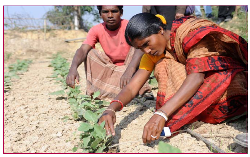
Drip irrigation practice has been introduced in drought prone areas in Bangladesh as an adaptation option

A new knowledge continuum must emerge which will connect local experiential knowledge with the global scientific knowledge of climate change. The rapidity with which climate change impacts are being