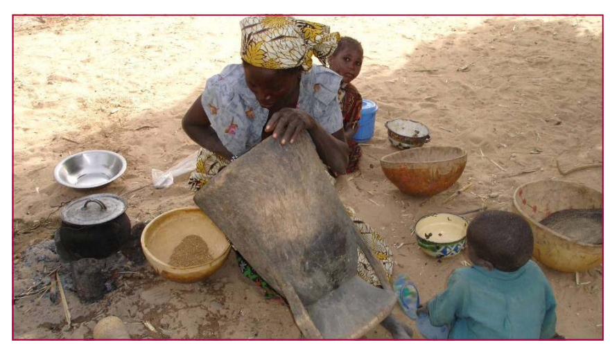
Climate change enhanced food insecurity, hunger and malnutrition in Africa and Asia

The various negative impacts of climate change are being felt severely, particularly in the poor and developing countries. Climate change has increased global food insecurity, hunger, hunger, poverty and inequity at regional level and within many societies. Climate change displaces people in many affected ecosystems (coastal zone, river basin and drought prone areas) and enhances rural to urban migration in many countries. Thus it increases social conflicts in the developing countries. In his recent statement, Dr. Achim Steiner, UN Under Secretary General has said, "Large number of people are already on move, with millions more are expected to follow as evidence of climate change mounts".