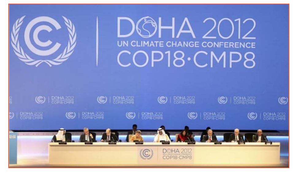
View of the inaugural session of COP-18 in Doha

President of Oatar termed it as a "golden opportunity" to make progress on a new global climate deal, but the CoP-18 ended with a weak "Doha Climate Gateway", which allows the negotiation process up to 2015 to agree on a more appropriate structure and wider targets for the second commitment period of KP. It is felt that the continuation of KP beyond December 2012 saved the global negotiation process and created a window to take up the process to an ambitious target level by involving the major emitters including the USA within 2015.