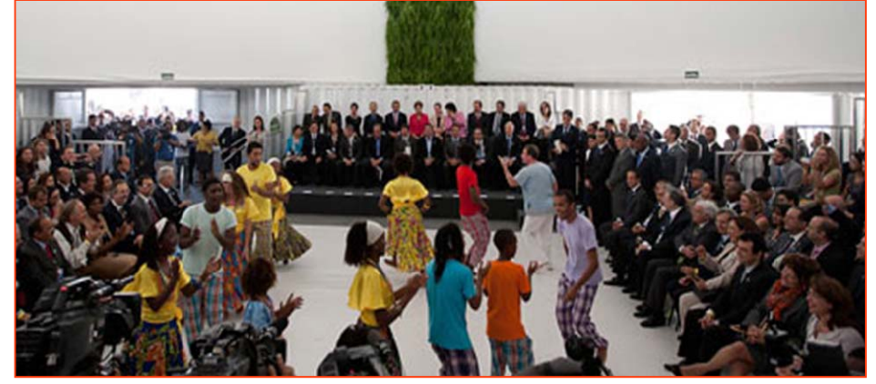
Opening session of the UNCSD in the Rio de Janerio, Brazil