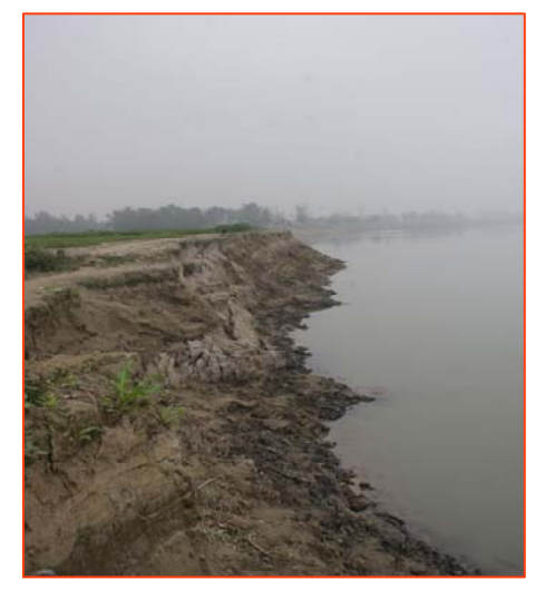
River bank erosion enhanced in the study areas by climate change induced frequent floods

Primary data collection was done mainly through Focus Group Discussions and Key Informant Interviews. Literature review has been done mainly from published peer reviewed papers, reports of the