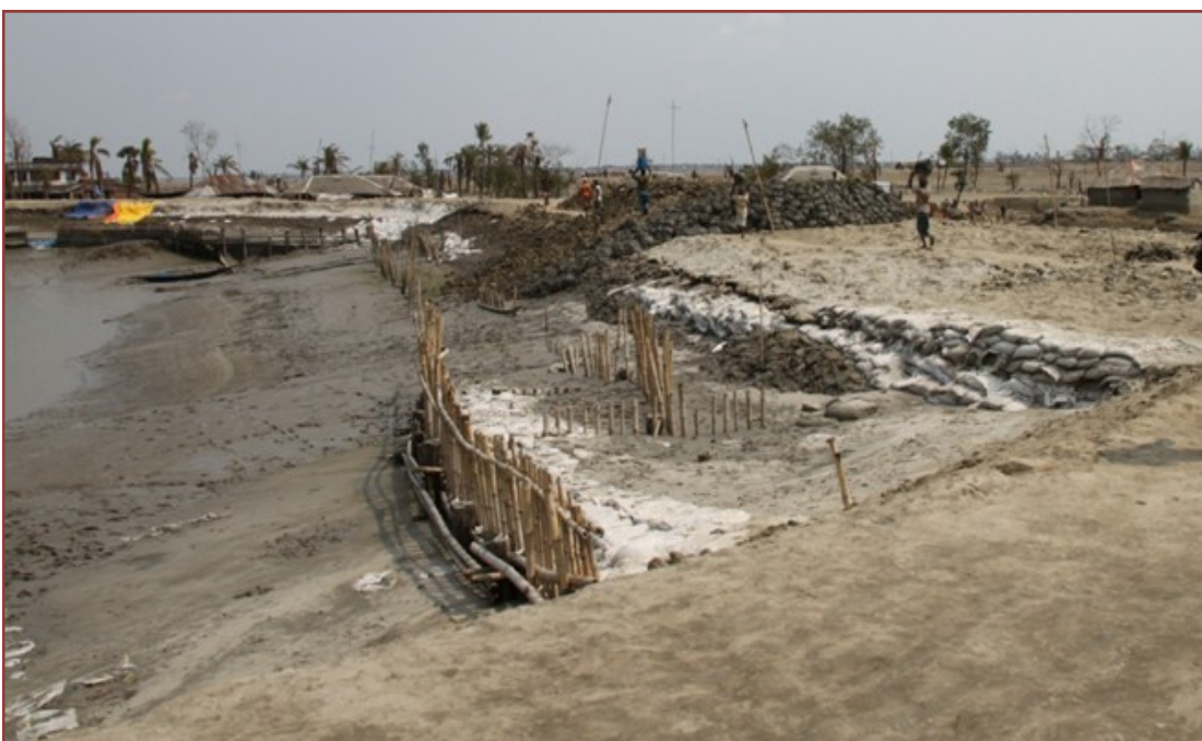
Photo: People are reconstructing a coastal embankment after it was breached by cyclone Aila.