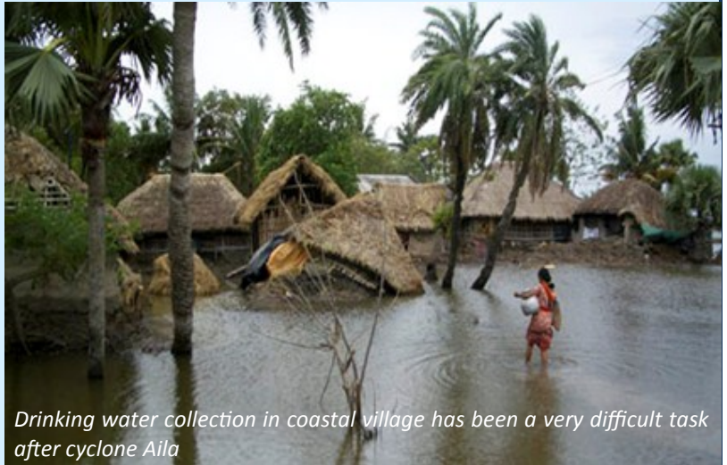
Drinking water collection in coastal village has been a very difficult task after cyclone Aila

A solution could be found however. Purchase of a large water tank at cost of around Tk. 15 thousand would solve the drinking water problem for Rebeka and her family.