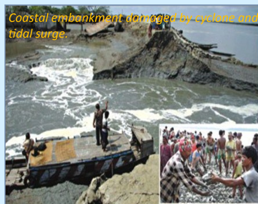
Coastal embankment damaged by cyclone and tidal surge.